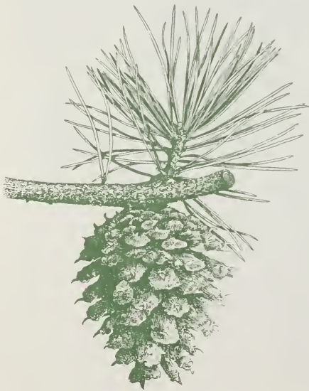
Virginia pine. (About one-half natural size)

The needles of pitch pine ( Pinus rigida ), are stiff, 3 to 6 inches long, dark yellow green, and three in a cluster. The cones are short and broad—1½ to 3 inches long, light brown, shiny, with small prickles. The cones often remain